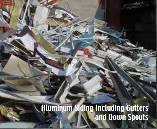
Aluminum Siding Including Gutters and Down Spouts