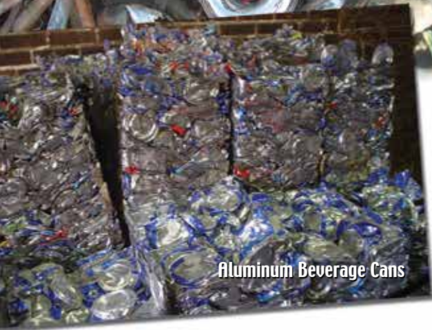
Aluminum Beverage Cans

We buy Recyclable Metals such as: Aluminum Beverage Cans, Brass Fittings, Copper Wire and Pipes, Aluminum Siding Including Gutters and Down Spouts.