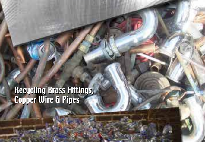
Recycling Brass Fittings, Copper Wire & Pipes